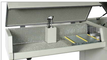
Sound-damped tunnel guard 01