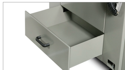
Swarf drawer 02