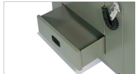
Swarf drawer 02