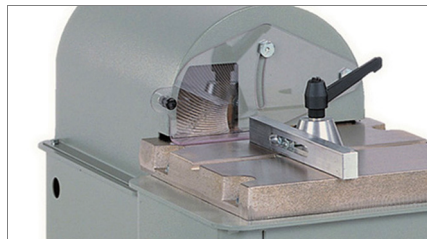
Rotary disc file guard 01