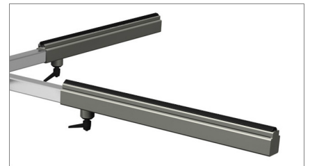
Anti-slip PVC contact surface 02