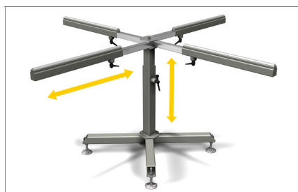
Rotary work table 04